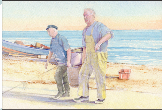
Sharing the Load, Sheringham