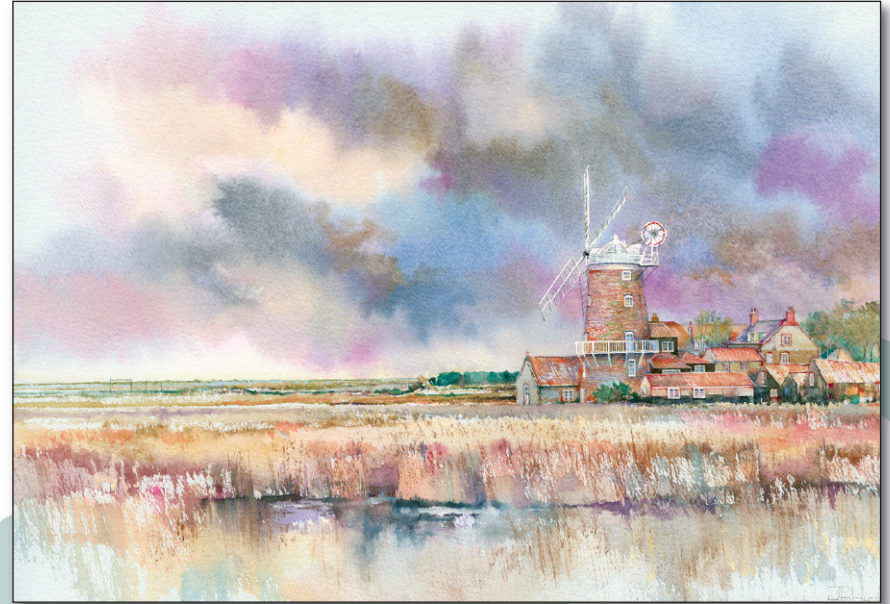
Cley Windmill Over the Reeds