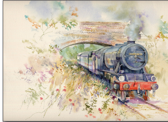
Full Steam Under Bridge Road